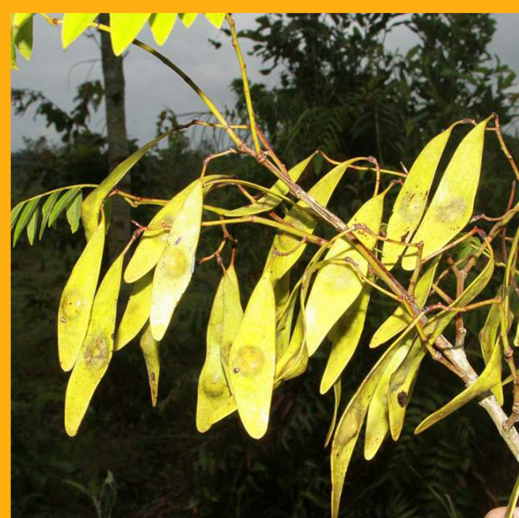
Dalbergia oliveri (Fruits)