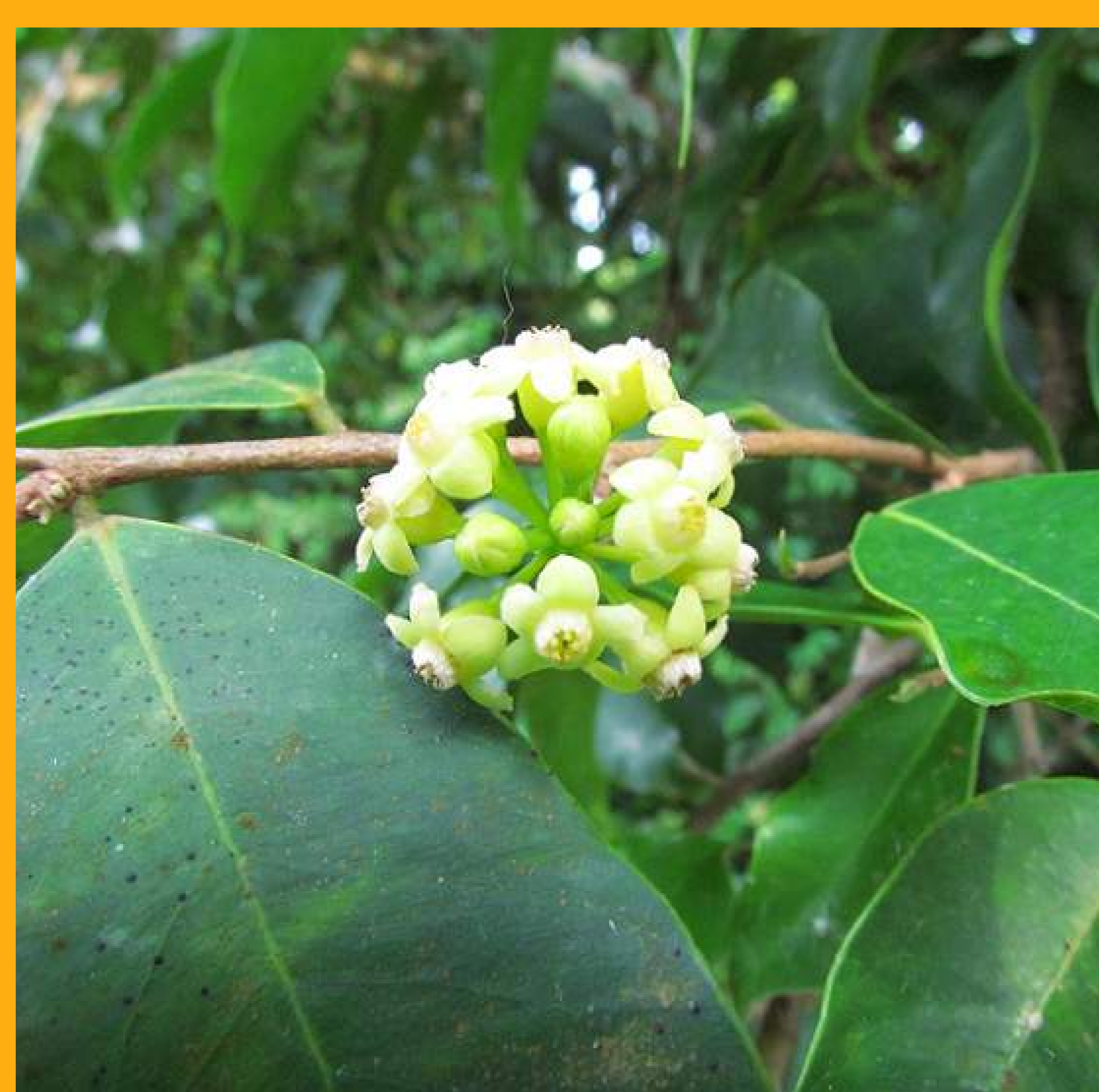
Aquilaria malaccensis (Flowers)