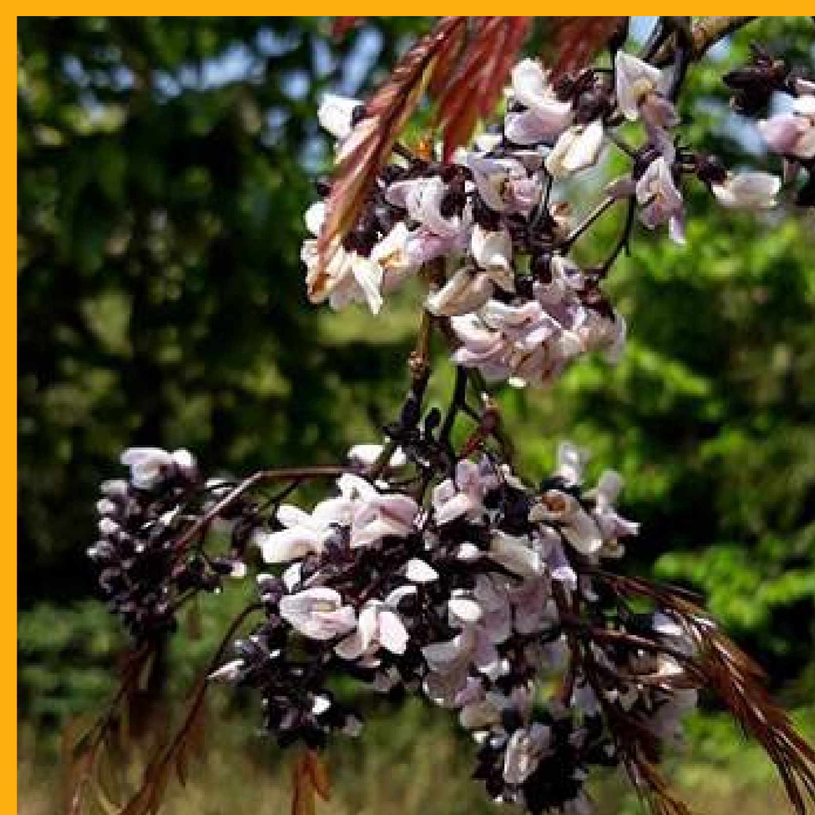
Dalbergia oliveri (Flowers)