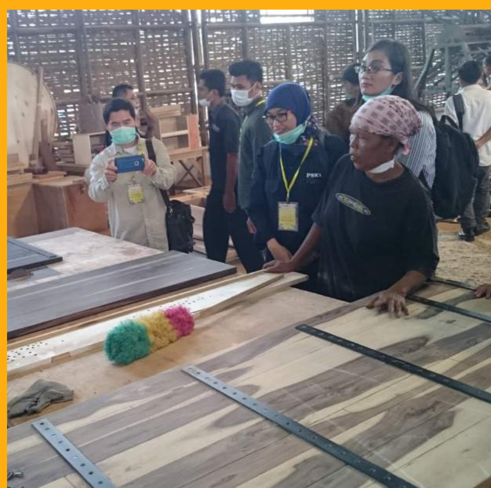
CITES Tree Species Programme Regional Meeting for Asia 25 to 29 June 2018 Yogyakarta - Indonesia

On 14 July 2017, the Secretariat and the European Commission announced the financial contribution of 8 million Euro by the European Union (EU) towards a project entitled: Supporting sustainable management of endangered tree species and conservation of the African Elephant . The CITES Tree Species Programme will support Parties that export valuable parts and derivatives of CITES-listed tree species by providing direct financial assistance and capacity building to Parties in taking conservation and management measures to ensure that their trade in timber, bark, extracts and other products from CITES-listed tree species is sustainable, legal and traceable. The programme aims to improve and strengthen forest governance, enforcement capacity to ensure benefit from long-term and contribute to the rural development in often remote areas, sustainable economic growth at a country level and long-term poverty alleviation.