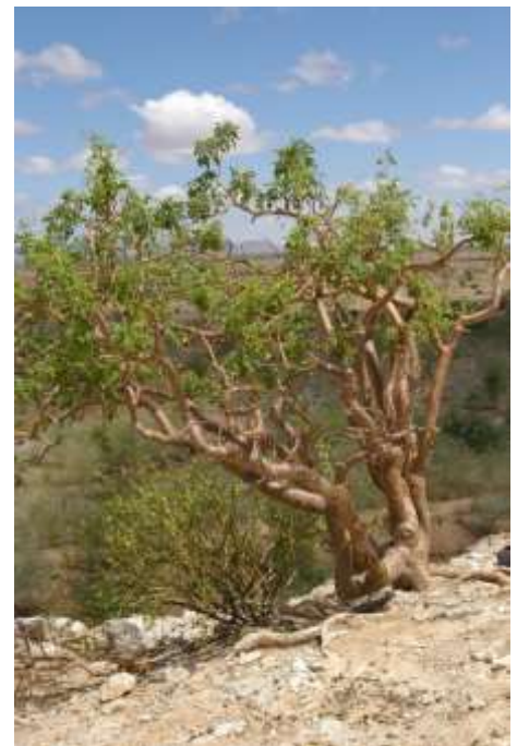
Boswellia ogadensis assessed a Critically Endangered in 2019

As we continue our discussions with the CITES Secretariat, we will focus on ways we can support the call for information on Boswellia spp. We will consider ways we can support other decisions taken at CoP18 notably the Production of a CITES Checklist for Dalbergia spp. and the development of NDFs for Rosewood tree species (NDFs). There is plenty of scope for enhanced cooperation between GTSG and the CITES Secretariat. We welcome your feedback on these preliminary ideas.