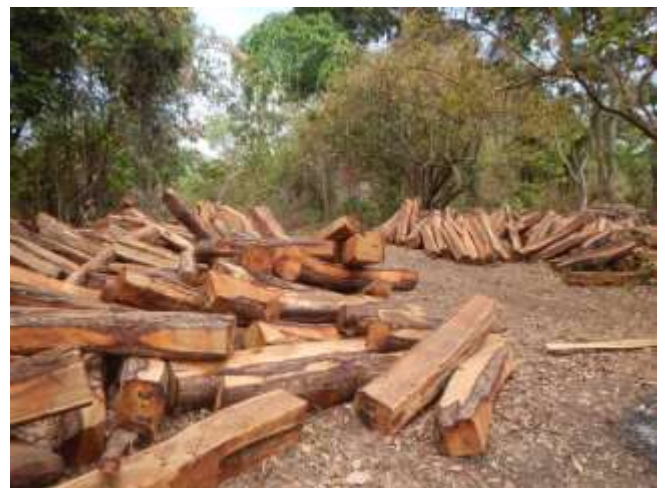
Stems of Pterocarpus erinaceus a threatened rosewood timber species from western Africa.

A key process of CITES implementation is the so-called non-detriment finding (NDF) . An NDF is undertaken by a country to ensure that international trade in a species will not be damaging to the survival of that species. Information required to carry out an NDF includes information on ecology, distribution and abundance of the species. Such inventory information is of course of great interest to GTSG members who are involved in assessing the conservation status of tree species. At the same time, the information we collect can be of direct relevance to CITES implementation and a basis for enhanced cooperation.