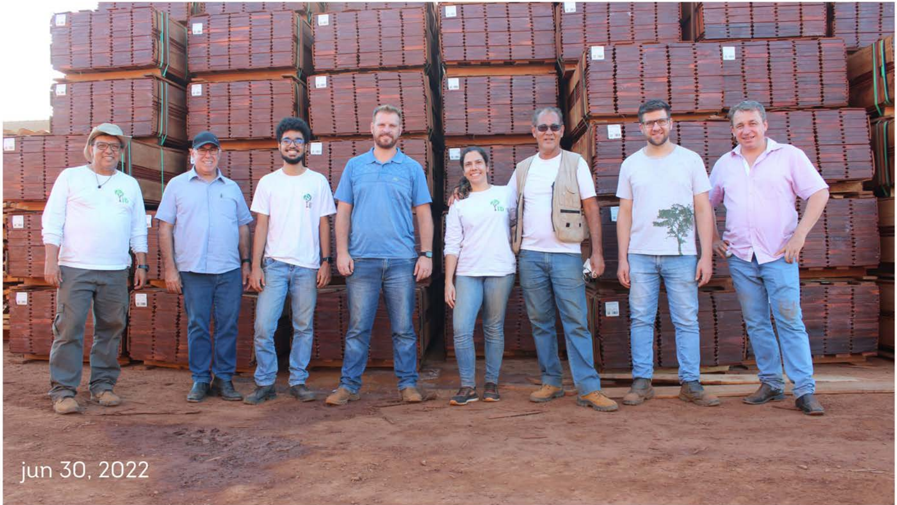
Madeflona Industrial Madeireira LTDA - Itapoã do Oeste, Rondônia - June, 2022