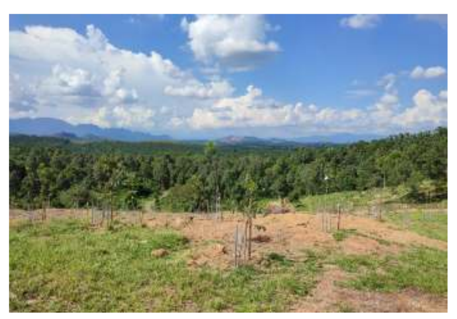
The Pahang arboretum established in 2021.