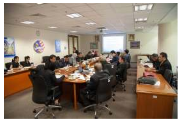
Stakeholders dialogue held in 2015 to gather feedback for the development of the Conservation Action Plan For The Threatened Agarwood Species Aquilaria malaccensis (Thymelaeaceae) In Peninsular Malaysia.

Each of the user groups has its own needs, and hence the messages will need to be properly defined and tailored to fit the needs and focus of each group. Also, as a means to deepen relationships among current user groups and establish new and diverse connections.