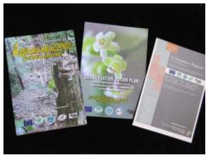
Conservation Action Plan For The Threatened Agarwood Species Aquilaria malaccensis (Thymelaeaceae) In Peninsular Malaysia, and two more documents produced in 2016.

articles and technical bulletins. Notwithstanding that, users of the arboretum can also publish their activities and share them with the community. In order to increase access and impact of such publications, suitable communication platforms and displays need to be available in public areas of FRIM and at the arboretum itself. Broadcasting the updates and other news such as research findings generated from the arboretum is an effective approach to widen the sphere of the audience.