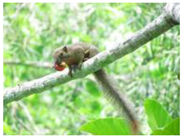
Squirrel from the species Callosciurus prevostii has been recorded to prey on Aquilaria malaccensis fruits.