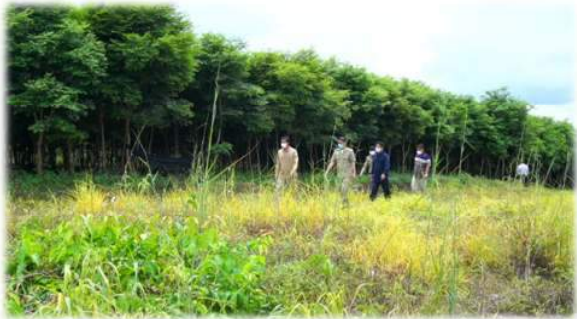
Privately-owned Dalbergia cochinchinensis plantation in Kampong Cham Province