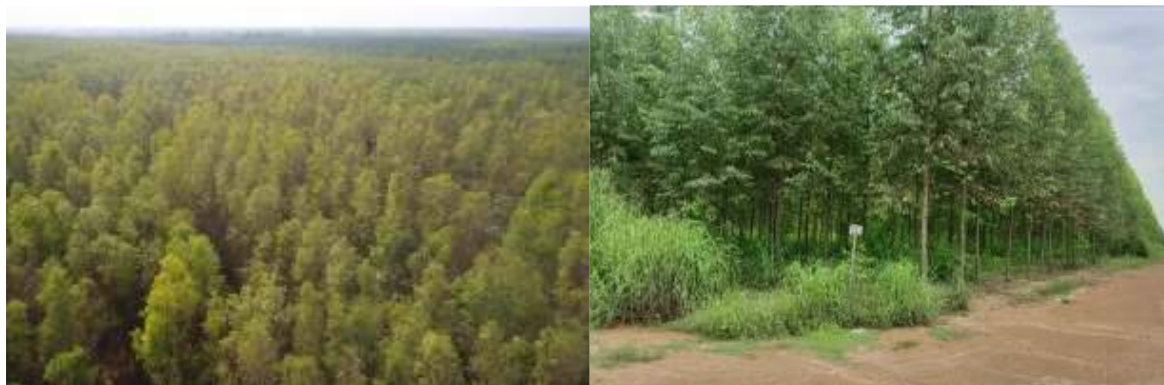
Figure 3. Eucalyptus Plantation of Think Biotech Co., Ltd, Forest-based PPP, Kratie Province.

from 1,800 ha to 34,007 ha per project site (DPP, 2022 2 ). These forest-based PPP projects have been granted the rights upon their requests to the RGC through the FA and MAFF to invest in forest plantations. All the projects are specifically focused on the establishment of tree plantations as part of forest restoration and for commercial purposes. The designated areas are generally degraded forests within one or many of the Forest Extension and Restoration Stations (FERS) or State Tree Plantations that have already been conducted primarily for forest plantation establishment and certified through a regulation (Prakas) by MAFF.