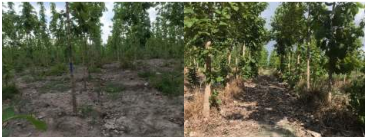
Figure 2. Teak plantation of Grandis Timber Co., Ltd (ELC project), Kampong Speu Province.

According to a review of their investment agreements, at least 17 ELCs among 229 ELCs have invested in tree plantations distributed in many provinces in Cambodia. Some of these ECLs are Grandis Timber Co., Ltd; Golden Land Development Co., Ltd; Wozhishan L.S Group; Hourling (Cambodia) International Insurance; Asia World Agriculture Development (Cambodia) Co., Ltd; Great Asset Agriculture Development (Cambodia) Ltd; Golden Land Development Co., Ltd; and G.G World Group (Cambodia) Development Ltd. The main tree species planted are Acacia species, Eucalyptus species, and Tectona grandis ( Figure 2 ).