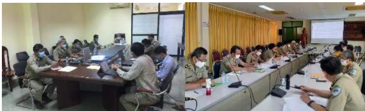
Figure 5. Internal-department and line-departments consultation meeting, 26 October-26 December 2020.

procedures in the private forest registration process in Cambodia, as well as incentivizing natural persons or juridical persons who are landowners to plant trees on their private land, and to increase the supply of timber and non-timber forest products from tree plantations for domestic consumption and export.