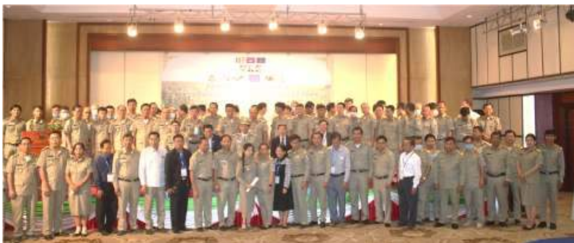
Figure 6. Consultation workshop to discuss and collect inputs for developing the guidelines and incentives for the establishment of private forest plantations, 26-27 November 2020.

In this regard, the development of the guidelines and incentives were regularly discussed and updated among project staff during their monthly project meetings, while three meetings were organized by the Department of Forest Plantations and Private Forest Development to discuss further the guidelines and incentives for the establishment of private forest plantations on 26 October and 21 December 2020, and 14 January 2021 ( Figure 5 ). One consultation workshop was also organized to discuss and collect inputs to finalize the guidelines and incentives for the establishment of private forest plantations from 26-27 November 2020 ( Figure 6 ).