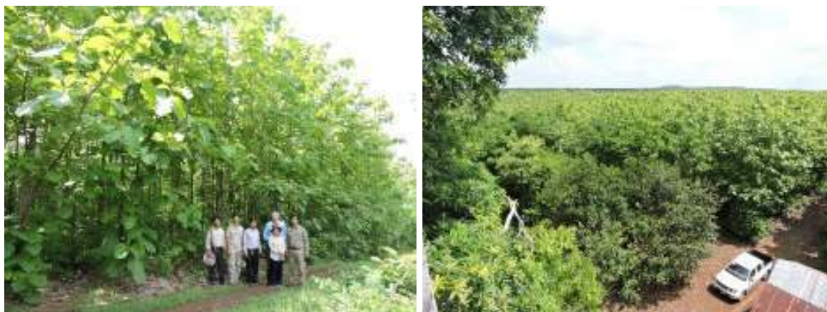
Figure 4. Private Household Teak Plantation, Han Chey Commune, Kampong Cham Province.

Tree plantations under this category are encouraged to register as private forests through the Rule of Private Forest and as guided in the recently-published Guidelines on Private Forest Registration in Cambodia.